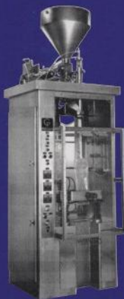
MODEL 90LC WITH POSITIVE DISPLACEMENT PUMP

restrooms; foil pouches of sterilized water for survival kits on trans-oceanic vessels; hot filled beans; meats; & sauces packaged at a restaurant chain central commissary; toppings and jellies in 2 lb. bags with endseals cut at 45 for use as pastry bags; reactants for both hot and cold packs; a freezer gel so viscous it can be carried in chunks, as well as many others. For more information on a model to meet your requirements for liquids in bags, please contact your local General representative or the factory.