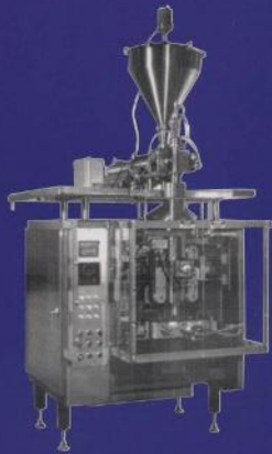
MODEL 48LC WITH PISTON FILLER